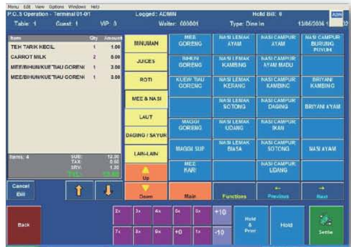
Food And Beverage Order