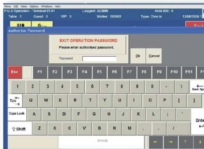
Exit Operation Password