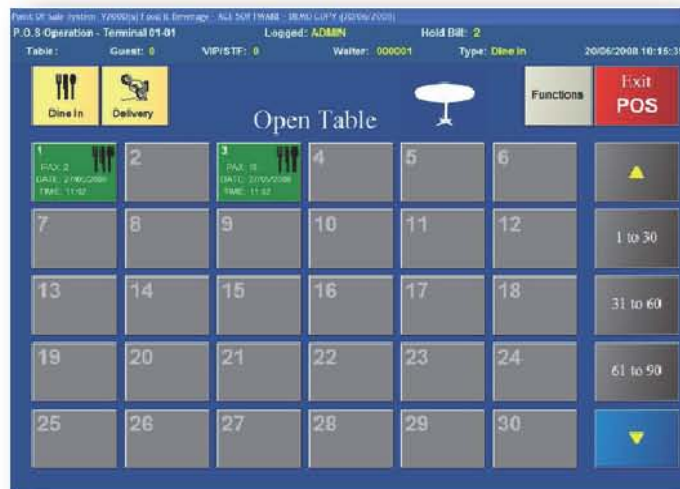
Standard Table Numbers